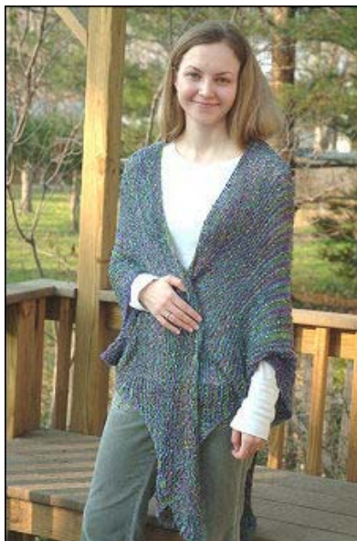
Violet Meadow Jacket